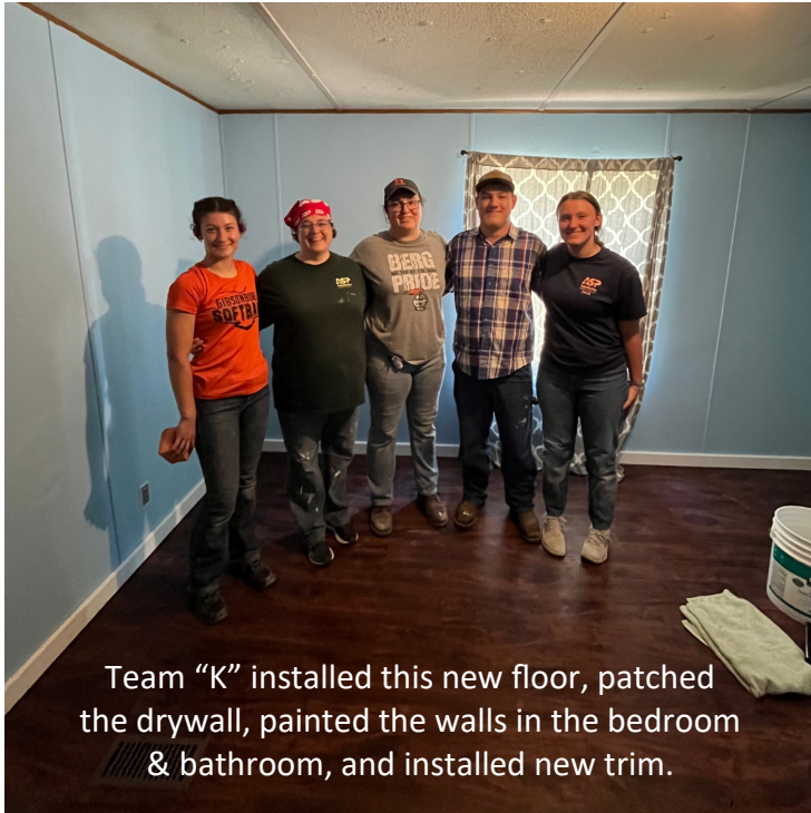
Team "K" installed this new floor, patched the drywall, painted the walls in the bedroom & bathroom, and installed new trim.