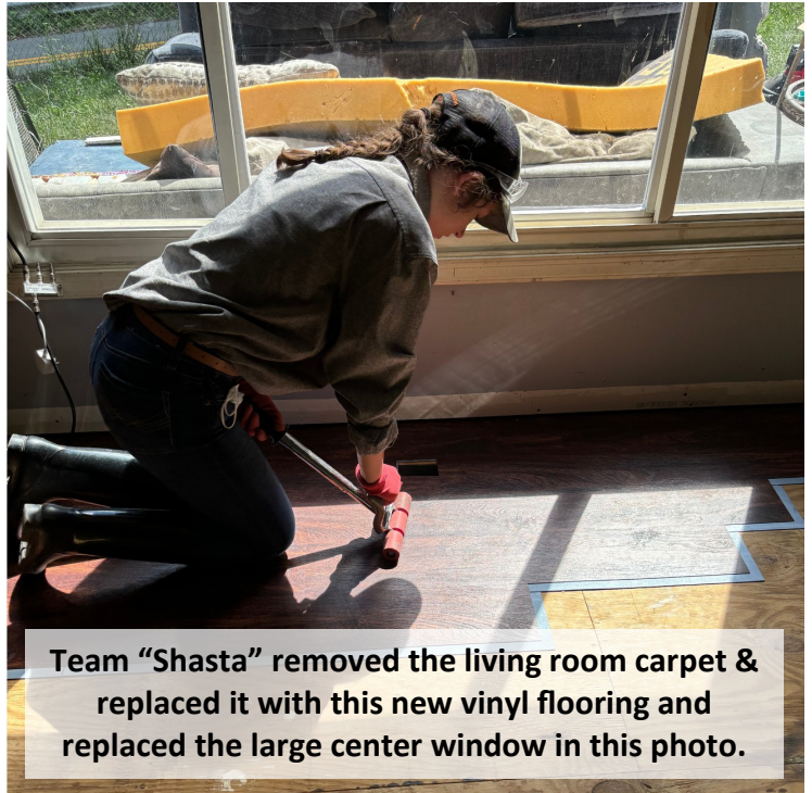
Team "Shasta" removed the living room carpet & replaced it with this new vinyl flooring and replaced the large center window in this photo.